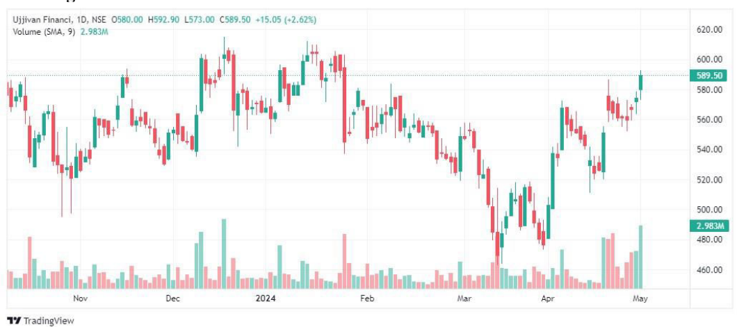
Chart before Merger-